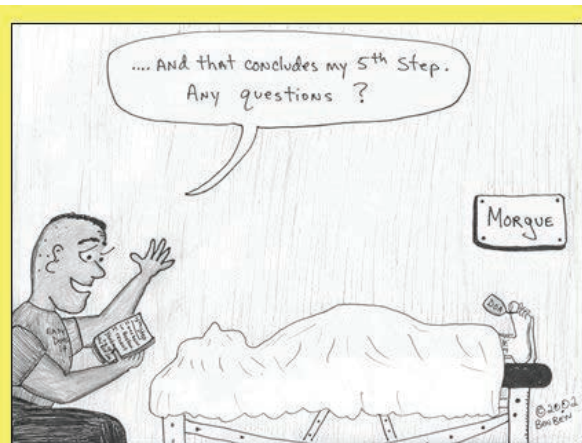
Morgue 5th Step

Tradition Five states that each group has but one primary Purpose – to carry its message to the alcoholic who still suffers. This tradition emphasizes the importance of the group and its members of recovery to others. The fellowship is based on the principle of service, and members are encouraged to help others recover from alcoholism. The tradition also stresses the importance of unity, reminding members that the group's primary purpose is to help others, not to engage in profit motives or personal gains and agenda. Step Five and Tradition Five reinforce the importance of self- reflection, humility, honesty, and service to others. These principles are critical. By carrying the message of recovery to others, members can help others find sobriety and fulfillment.