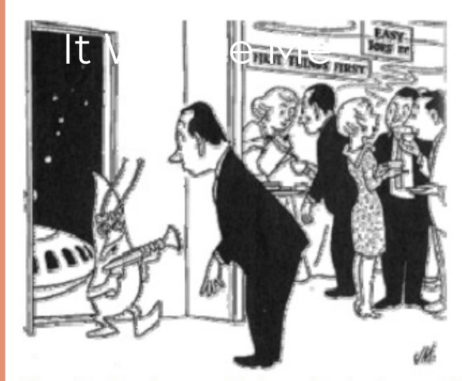
"My drinking has me feeling a little alienated."

I currently live in Nassau County and began doing service at Nassau Intergroup. I also served for Nassau County General Service. I then became the DCMC for Nassau County. I gave reports at LICYPAA,, Distrito 2-14 and Assemblios. Nassau County General Service held a County Inventory in December of 2020. During that inventory, there was a discussion regarding diversity. Since I was already doing service for Nassau County, I asked myself this question: "would I be willing to stand as a Committee Chair? I love alcoholics anonymous and believe the need to have diversity in our AA community. Diversity is an action.